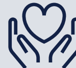
Grants and charitable donations